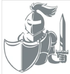
Reine Rank Law Practice