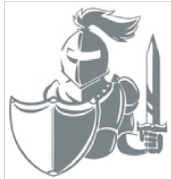
Reine Rank Law Practice